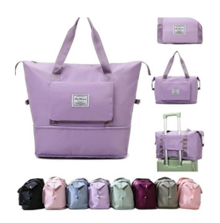
FOLDABLE SHOPPING BAG