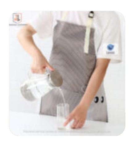
ADJUSTABLE CHEF APRON