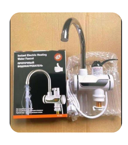
INSTANT WATER GEYSER