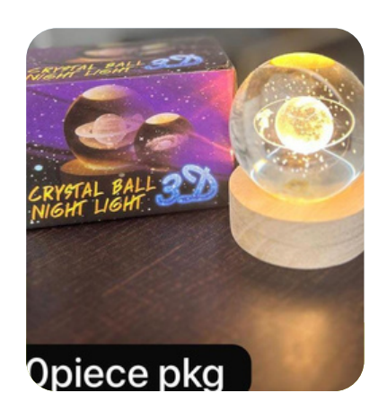
CRYSTAL BALL MIX DESIGNB LAYER JELLYFISH LIGHT