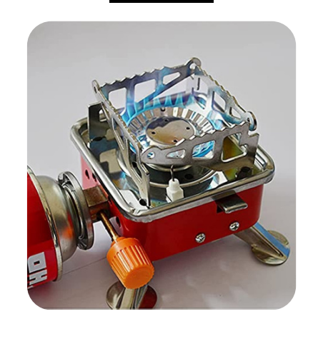
MINI PORTABLE STOVE