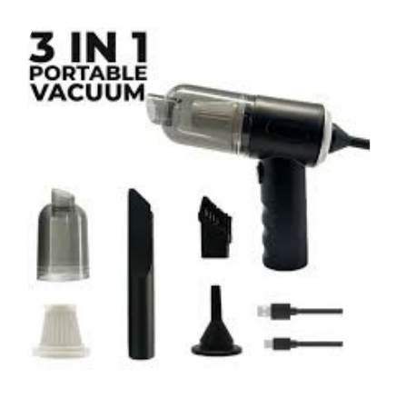
3 IN 1 CAR VACCUM CLEANER