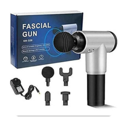
FACIAL GUN MASSAGER