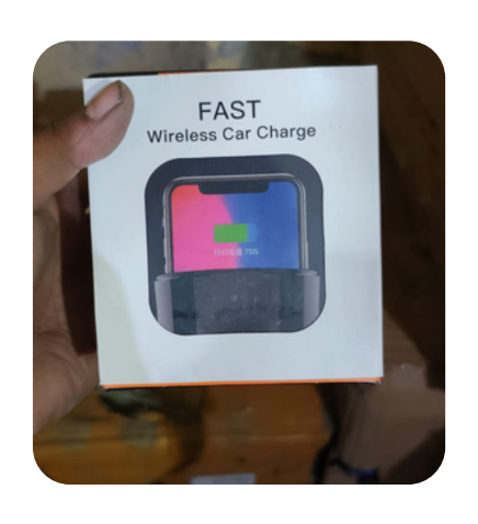
USB CAR CHARGER