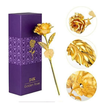
ARTIFICIAL GOLDEN FLOWER