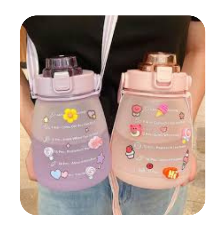
STAINLESS STEEL BOTTLE