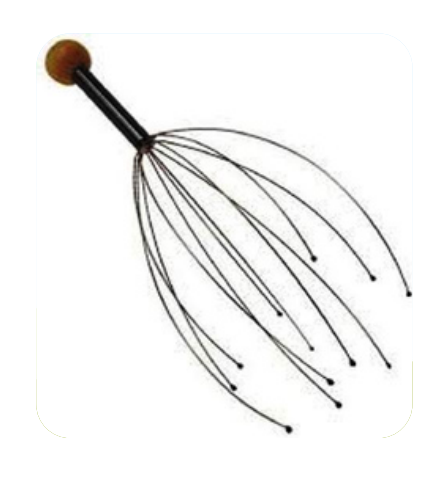
BOKAMA HEAD MASSAGER