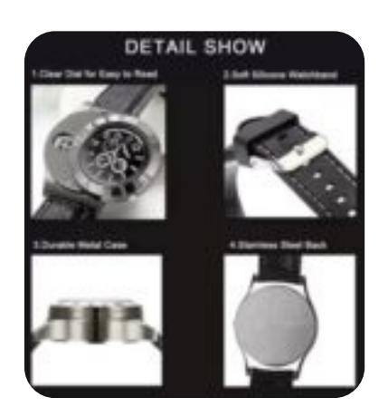
RECHARGEABLE WATCH LIGHTER