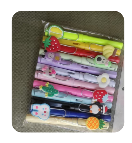
CARTOON INKLESS PENCIL