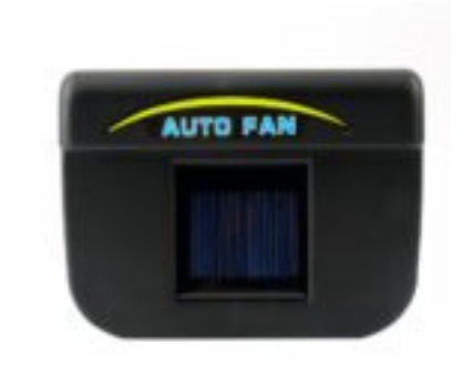
AUTO CAR CLEANER