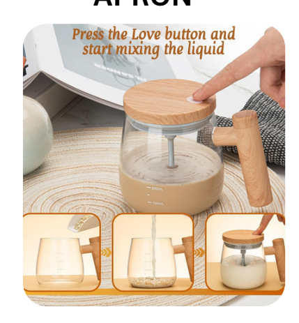
ELECTRIC MIXING CUP