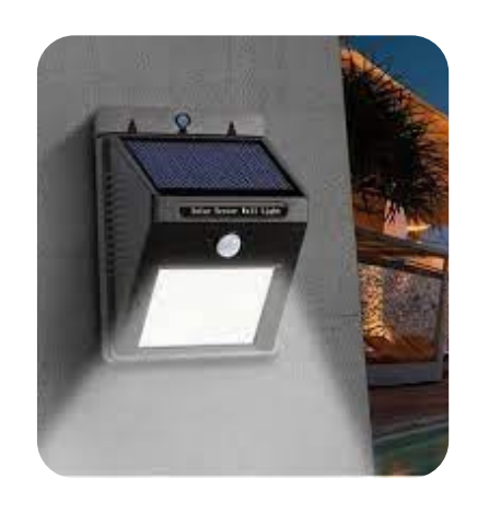
SOLAR WALL LIGHT