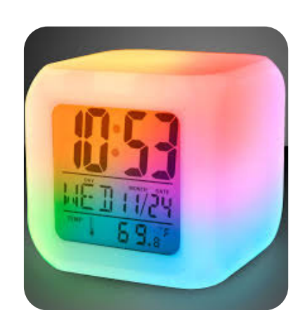
color changing clock