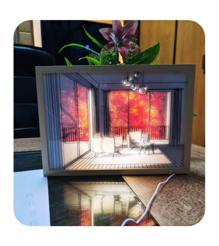
WOODEN PHOTO FRAME