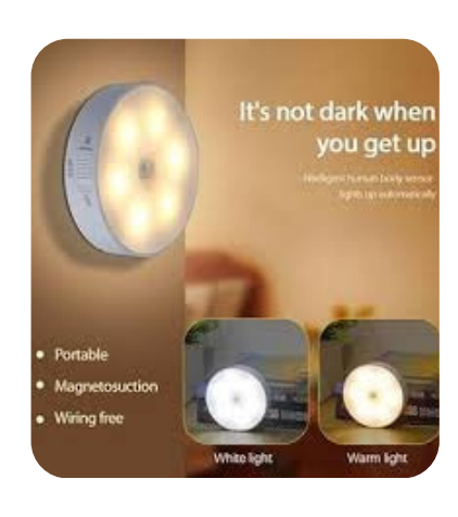
BODY INDUCTION LAMP