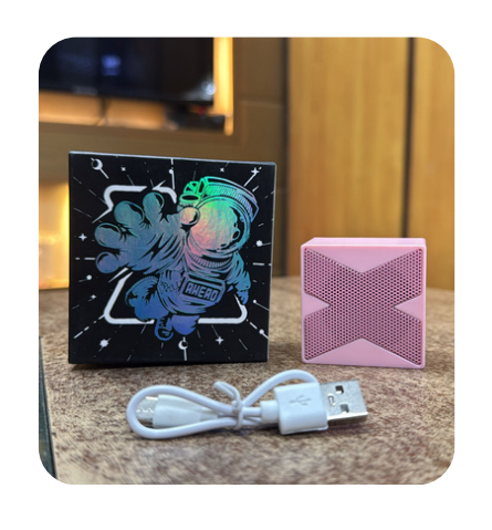
X MINI SPEAKER