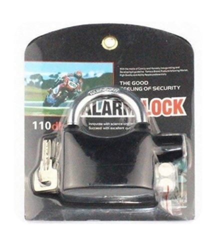
ALARM LOCK (FIBER)