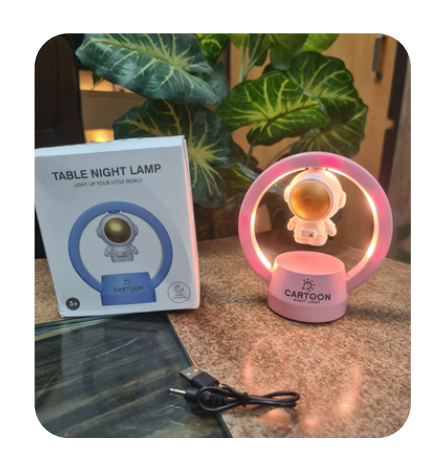
KIDS NIGHT LAMP