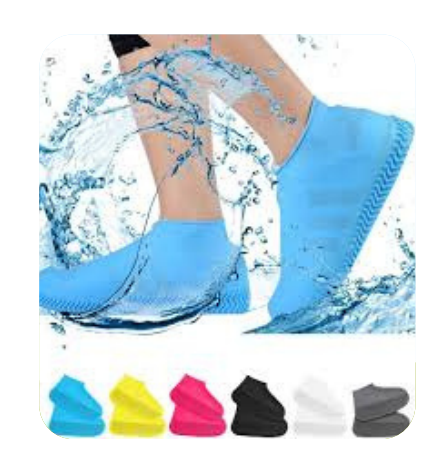
WATER SILICONE SHOE COVER