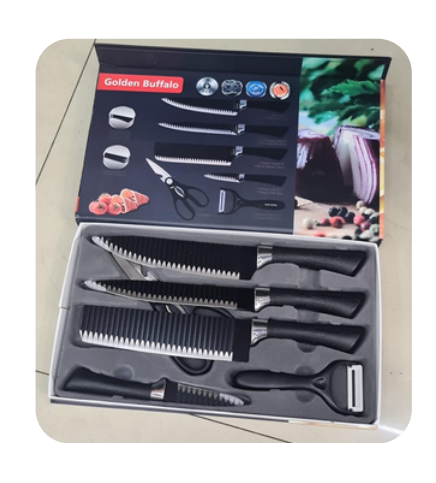
NON STICK KNIFE SET