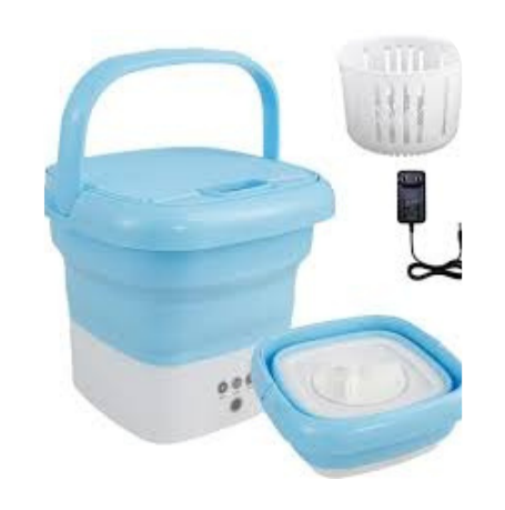
MINI WASHING MACHINE