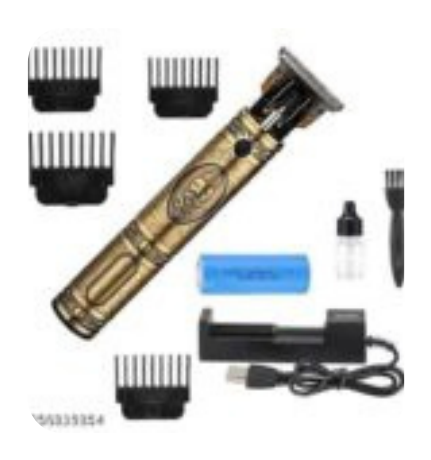
PROFESSIONAL HAIR TRIMMER