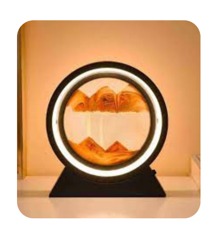
TABLE LAMP PRODUCT