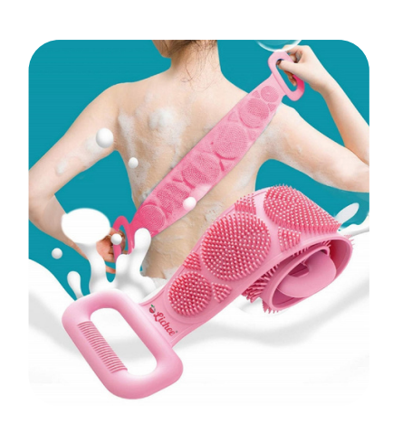
BACK SCRUBER BELT