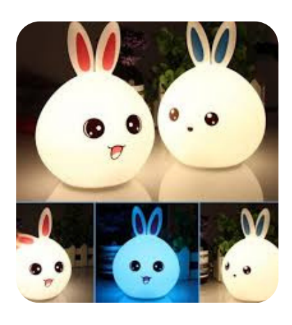
ROUNDSHAPE TABLE LED MUSIC ATMOSPHERE LAMP LAMP CU