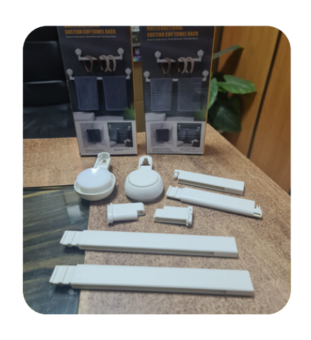
MULTIUSE TOWEL RACK