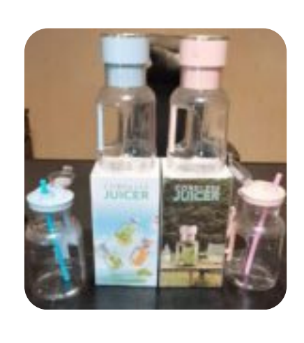
PORTABLE CORDLESS JUICER