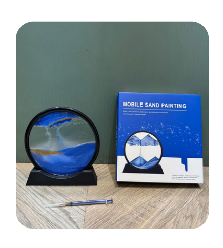
MOBILE SAND PAINTING