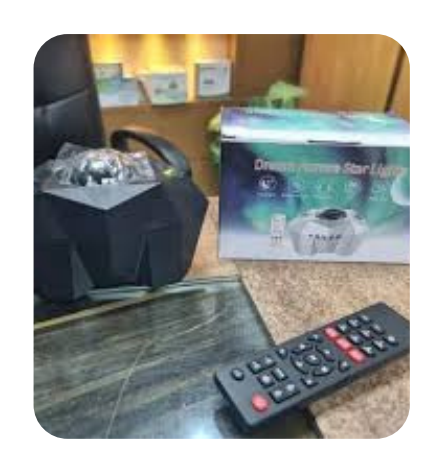
SILICONE DEER LAMP CAMPING BULB DREAM ARORA PROJECTOR LIGHT