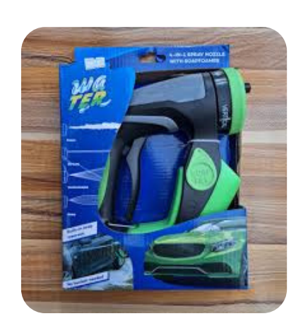
4 IN 1 WATER SPRAY GUN