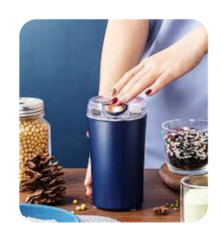
MINI COFFEE GRINDER