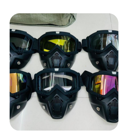
BIKE MASK PLASTIC