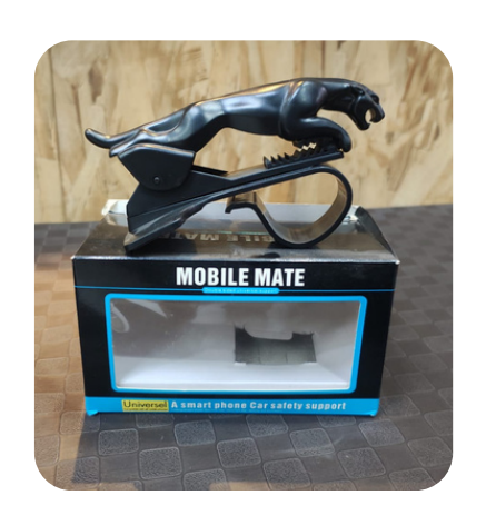
JAGUAR MOBILE STAND