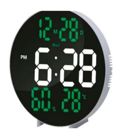
LED WALL CLOCK