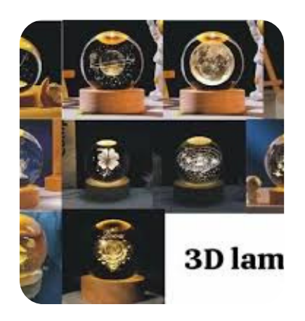
TABLE LAMP/LIGHT PRODUCT