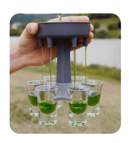
6 GLASS LIQUID DISPENCER