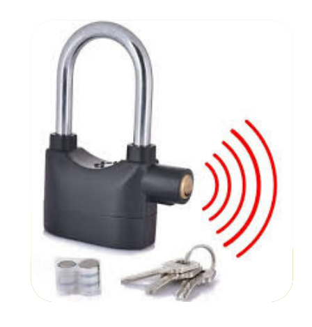
ALARM LOCK (COPPER)