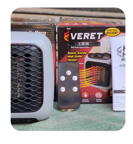
HANDY HEATER 800W