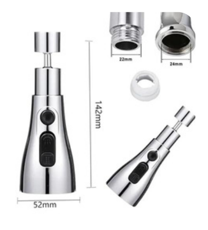
FAUCET SPLASH HEAD