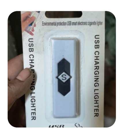
USB RECHARGEABLE LIGHTER