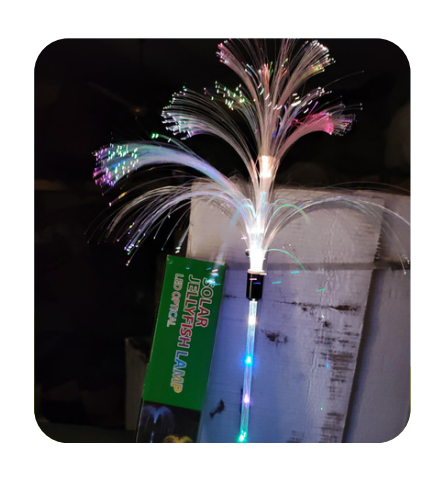
3 LAYER JELLYFISH LIGHT