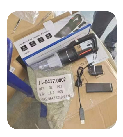
CORDLESS VACCUM CLEANER