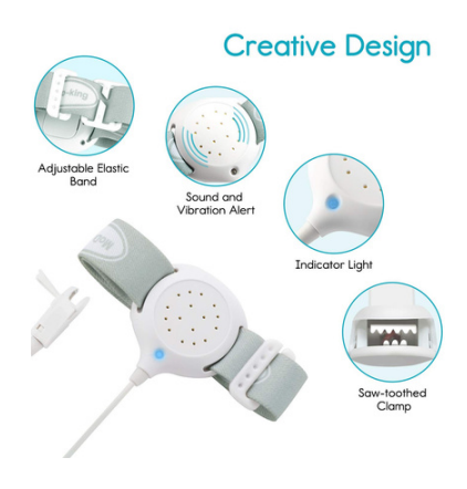
SENSOR BEDWEATING ALARM