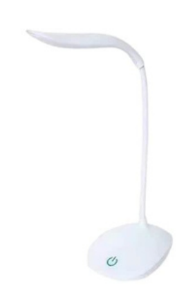
STUDY TABLE LAMP