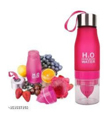
H2 WATER BOTTLE