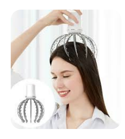
ELECTRIC HEAD MASSAGER