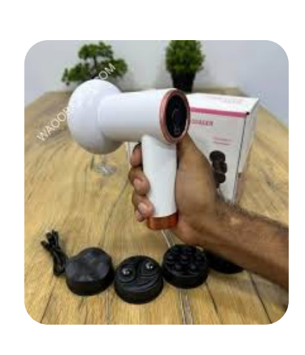
DEEP ROLLING MASSAGER