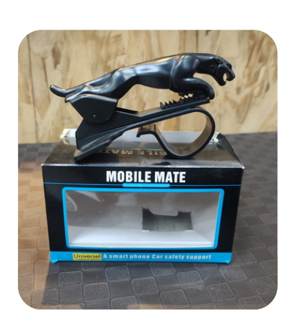
JAGUAR MOBILE STAND