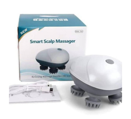
SMART SCALP MASSAGER