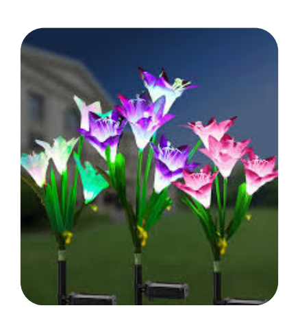
LILLY SOLAR LIGHT